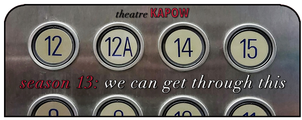
"Isolation offered its own form of companionship" ~ Jhumpa Lahiri

Over the past several months most of us have found ourselves in various states of isolation. theatre KAPOW was just days away from beginning rehearsals for the third show of our 12th season when the reality of the pandemic arrived in New Hampshire effectively closing down theatres all over the state. Like so many people across the globe, our activities moved from close and personal interactions to the decidedly distant and impersonal world of video conferencing.