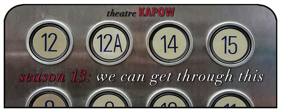
"Isolation offered its own form of companionship" ~ Jhumpa Lahiri

Over the past several months most of us have found ourselves in various states of isolation. theatre KAPOW was just days away from beginning rehearsals for the third show of our 12th season when the reality of the pandemic arrived in New Hampshire effectively closing down theatres all over the state. Like so many people across the globe, our activities moved from close and personal interactions to the decidedly distant and impersonal world of video conferencing.